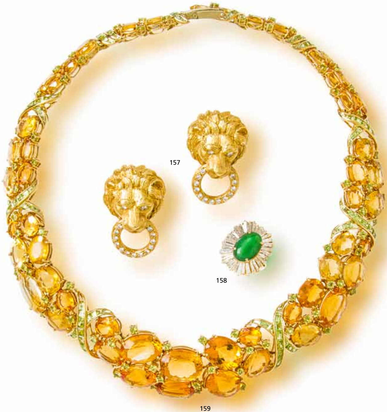
157 A pair of eighteen karat gold and diamond door knocker earclips, Van Cleef & Arpels each designed as a textured gold lion's head, grasping a ring in its mouth, enhanced by circular-cut diamonds; signed VCA for Van Cleef & Arpels, no. 41792.7; estimated total diamond weight: 1.30 carats; gross weight approximately: 46.2 grams; length: 1 1/2in. $4,000 - 6,000