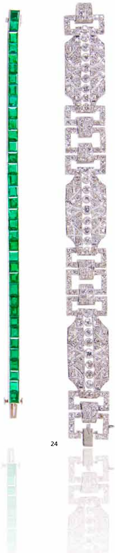
23 An emerald bracelet the line bracelet comprising thirty-six calibr -cut emeralds; estimated total emerald weight: 15.00 carats; mounted in platinum; length: 6 3/4in. $6,000 - 8,000

Property from a Private Oregon collection