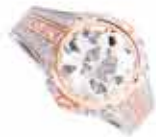
121 A black opal and diamond ring centering a reversible oval double cabochon black opal, surrounded by round brilliant-cut diamonds, with pavé-set diamond foliate shoulders and engraved mount; opal weighing approximately: 5.52 carats; estimated total diamond weight: 1.14 carats; mounted in eighteen karat white gold; size 6 1/4 $10,000 - 15,000