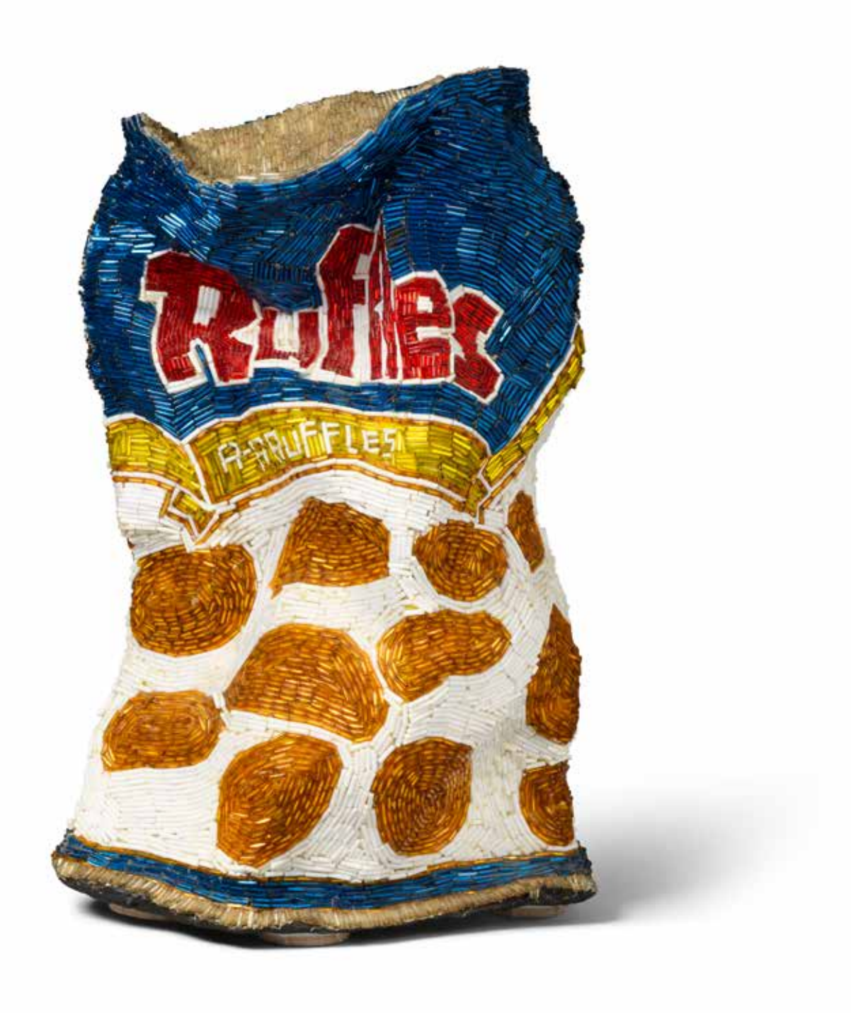
Bonhams 7601 W. Sunset Boulevard Los Angeles, California 90046