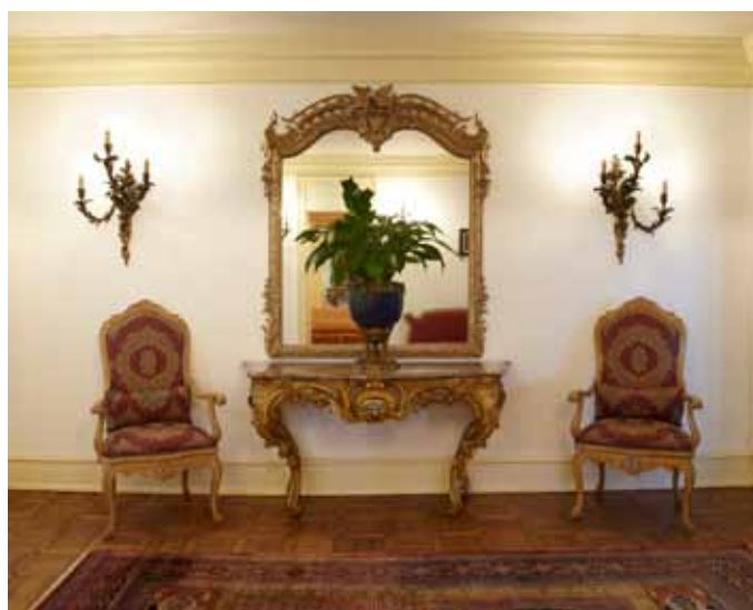
Lots 274-277 in situ in Bel Air