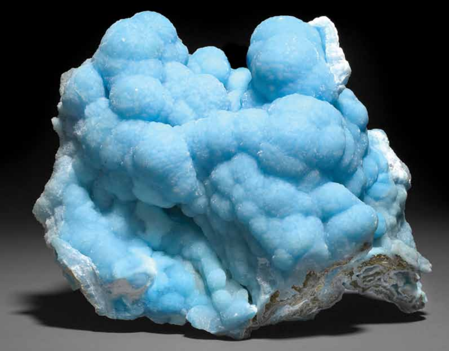
International Auctioneers and Appraisers - bonhams.com/naturalhistory

Rare and Large Hemimorphite Chihuahua, Mexico Measuring 13 x 10 x 6in $6,000 - 8,000 Including Minerals from the Estate of Carey A. Parshall, Stamford, CT