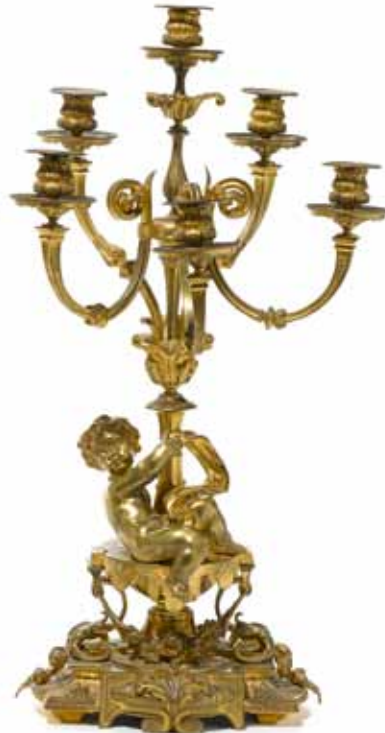
2017 A PAIR OF FRENCH GILT BRONZE SIX LIGHT CANDELABRA LATE 19TH CENTURY The scroll branches supported by a seated putto, on shaped foliate and flowerhead bases. height 27in (68.5cm) $1,500 - 2,000