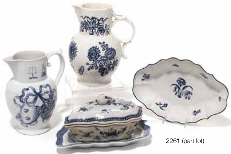
2261 (part lot)