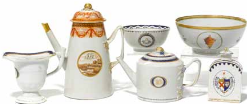
2326 (part lot)

The oval basket with glass liner supported by standing putti, on shaped giltwood base, inscribed Maison ALPH GIROUX à Paris . height 11 1/2in (29cm); width 22in (56cm); depth 13in (33cm) $8,000 - 12,000