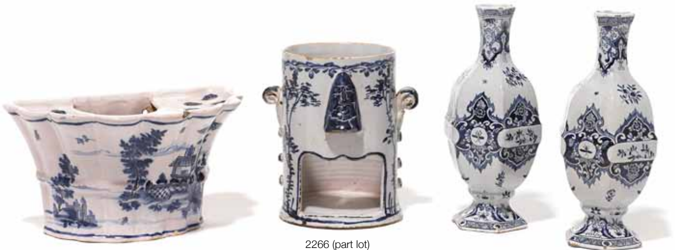
2266 (part lot)