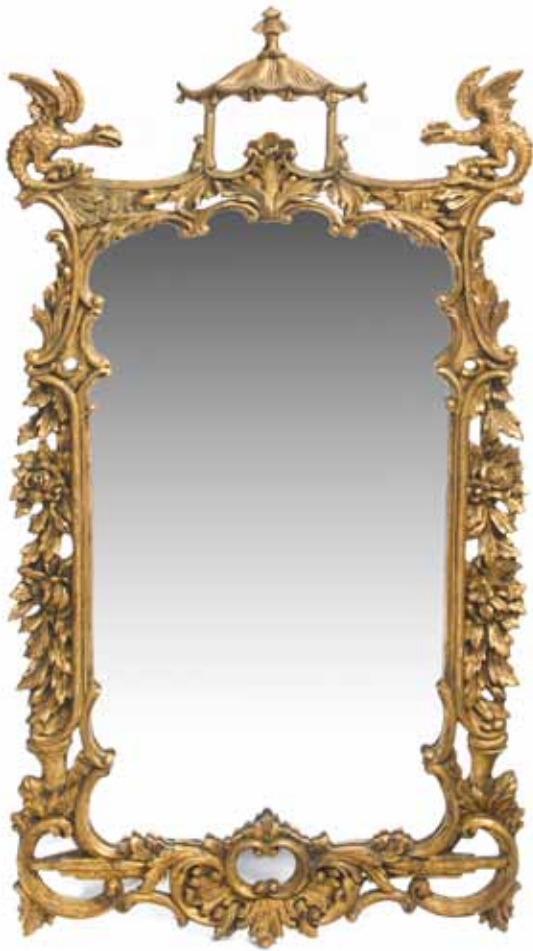
2246 (a pair)