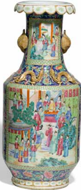
2016 A PAIR OF CHINESE ROSE MEDALLION PORCELAIN VASES LATE 19TH CENTURY Decorated with panels of elegant figures in formal landscapes within borders of birds, flora and fauna and applied with birds and dragons, on circular foot. height 23 1/2in (59.5cm) $2,500 - 3,500