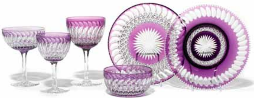
2459 (part lot)