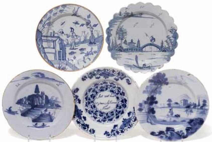
2263 (part lot)