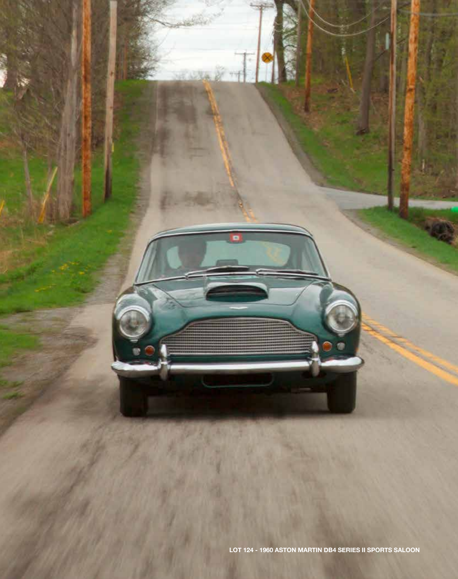
LOT 124 - 1960 ASTON MARTIN DB4 SERIES II SPORTS SALOON