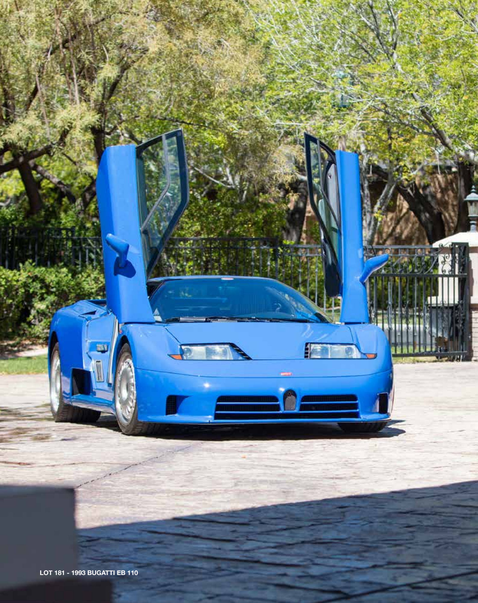
LOT 181 - 1993 BUGATTI EB 110