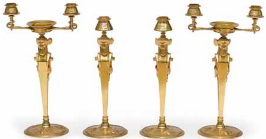
64 A PAIR OF FRENCH GILT BRONZE CANDELABRA IN THE GREEK REVIVAL TASTE Together with a similar pair of candlesticks. heights 14 and 12 1/2in (35.5 and 32cm) $1,000 - 1,500