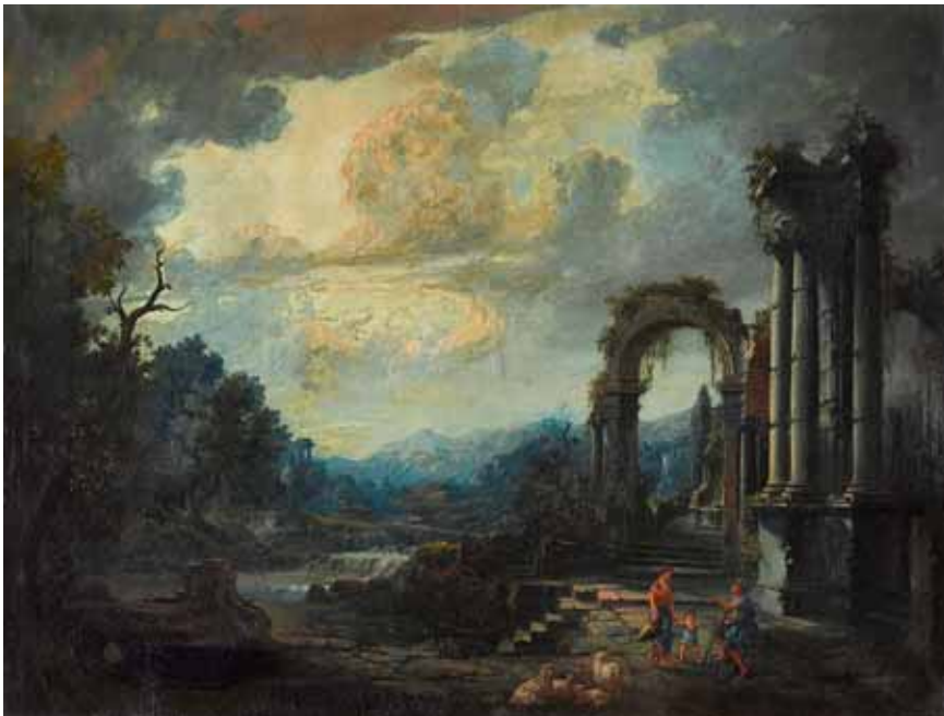
63 ITALIAN SCHOOL (18TH/19TH CENTURY) A capriccio view with figures by ruins oil on canvas 30 x 40in (76.2 x 101.6cm) $3,000 - 5,000