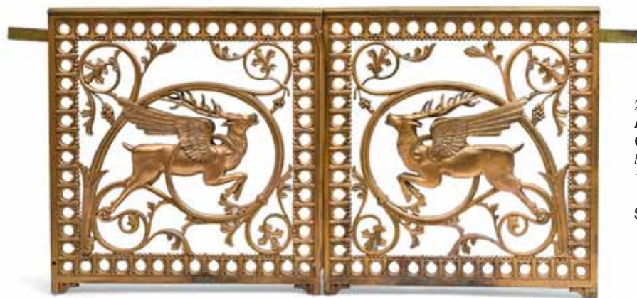
224 A PAIR OF UNUSUAL GILT BRONZE GATES Each panel height 31 1/2in (80cm); width 29 1/2in (75cm)