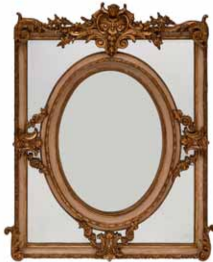
331 A PAIR OF NEOCLASSICAL STYLE PARCEL GILT AND PAINT DECORATED GESSO MIRRORS