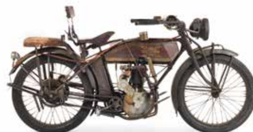
1914 EXCELSIOR SINGLE 2-SPEED US$39,000 - 52,000 £30,000 - 40,000 *£39,000