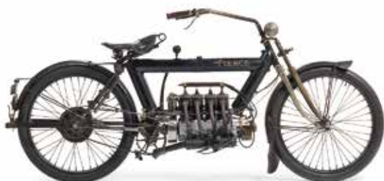
1911 PIERCE FOUR US$100,000 - 160,000 £80,000 - 120,000 *

CATALOGUE +44 (0) 1666 502 200 subscriptions@bonhams.com