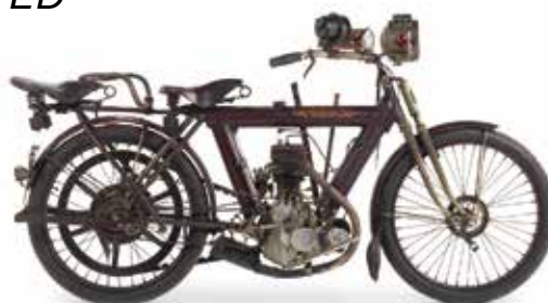
1912 PIERCE 592CC SINGLE US$59,000 - 72,000 £45,000 - 55,000 *