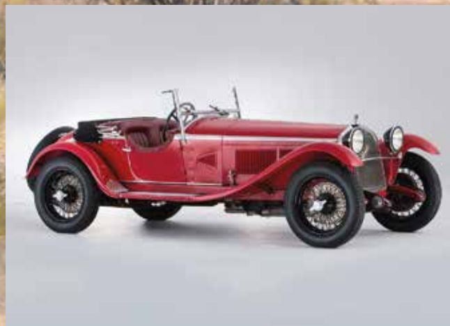
Originally delivered new to Gustav Eisenmann, ex-Grant White 1931 ALFA ROMEO 6C 1750 5TH SERIES SUPERCHARGED GRAN SPORT SPIDER Coachwork by ZAGATO Sold for $2,805,000