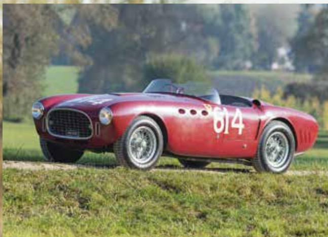
Ex Scuderia Ferrari 1952 FERRARI 340 AMERICA SPIDER COMPETIZIONE Sold for $6,380,000

+1 (415) 391 4000, West Coast +1 (212) 461 6514, East Coast motors.us@bonhams.com