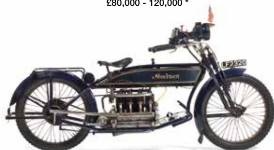
1913 HENDERSON 1,068CC FOUR US$91,000 - 120,000 £70,000 - 90,000 *