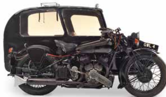
1938 BROUGH SUPERIOR 982CC SS80 & BLACKNELL SIDECAR US$65,000 - 78,000 £50,000 - 60,000 *