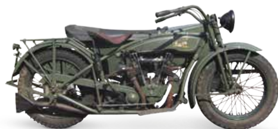
1923 EXCELSIOR 20R COMBINATION US$24,000 - 31,000 £18,000 - 24,000 *