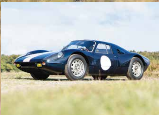
Matching numbers Highly original and preserved One owner for the past 28 years 1964 PORSCHE 904 GTS Sold for $2,310,000