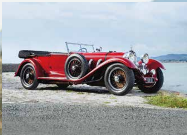
1928 MERCEDES-BENZ TYP S 26/120/180 SUPERCHARGED SPORTS TOURER Coachwork by Erdmann & Rossi Sold for $4,812,500