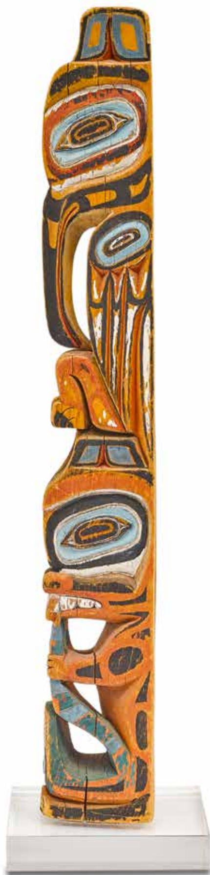
575 (alternate view)