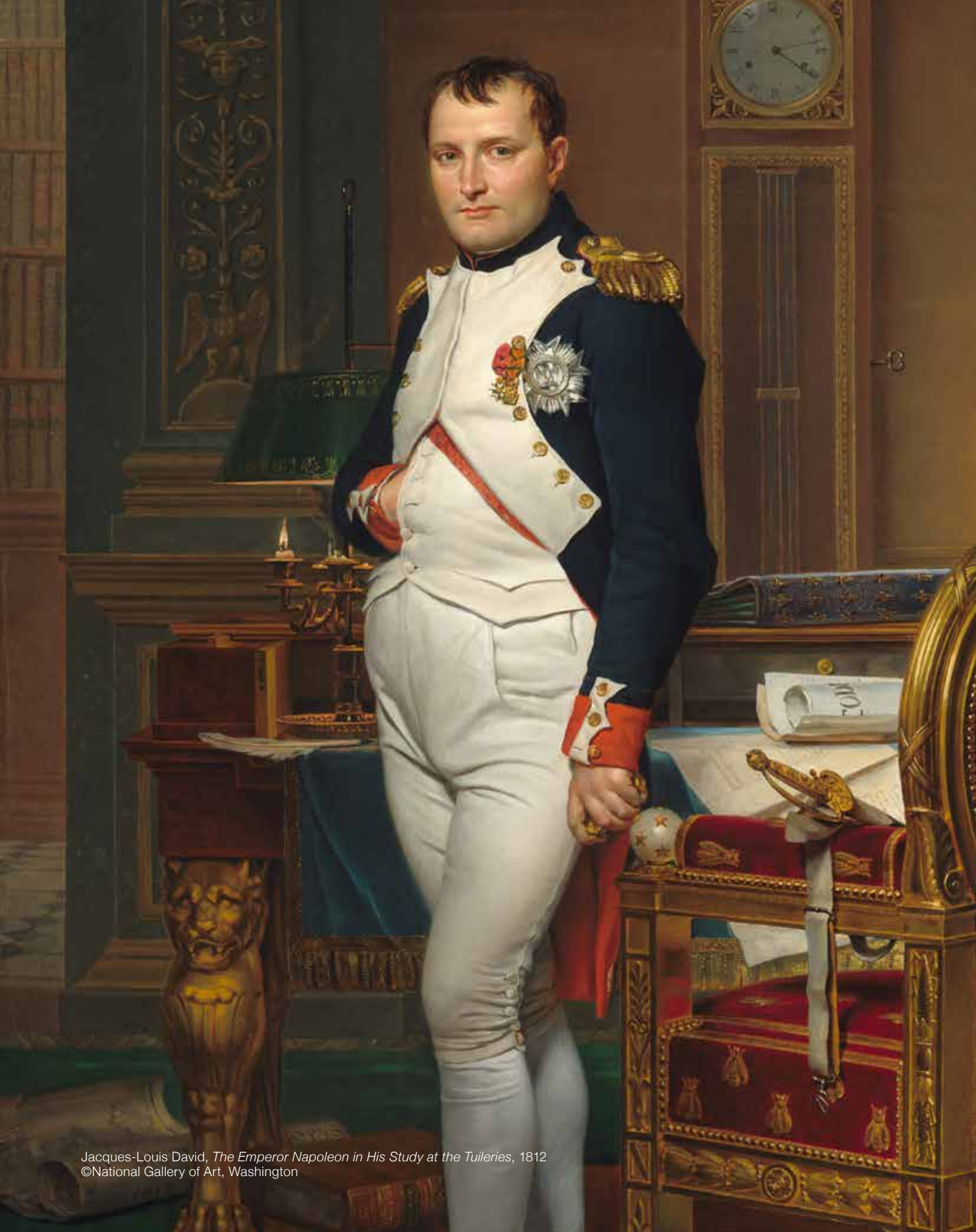
Jacques-Louis David, The Emperor Napoleon in His Study at the Tuileries, 1812